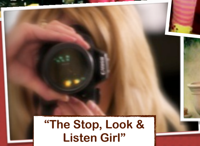
"The Stop, Look & Listen Girl"

Yes, there is a spiritual truth to these feathers :)