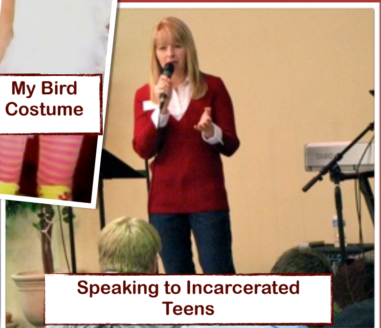
Speaking to Incarcerated Teens