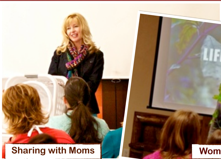
Sharing with Moms